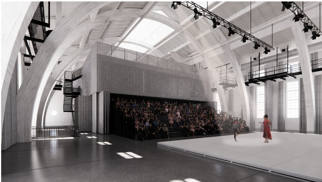
Temporary illustration by Mikkelsen Arkitekter

This is a total renovation of a historically listed building, which was built in the 1920s.