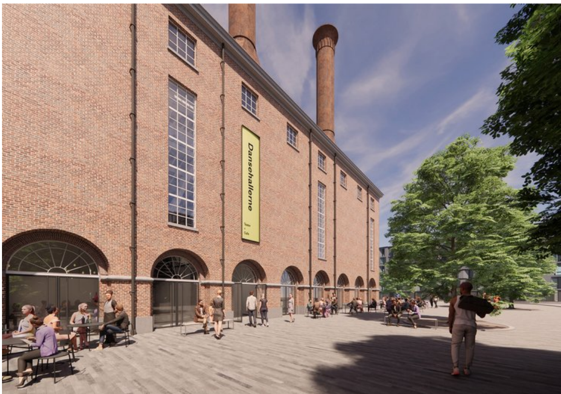
Temporary illustration by Mikkelsen Arkitekter

A new house for professional dance and choreography sees the light of day when Kedelhuset in Carlsberg City District, a historic and unique industrial building, will be transformed into a modern facility. Dansehallerne becomes center for future unfoldings of performing arts for the benefit of people in Copenhagen and Denmark in general.